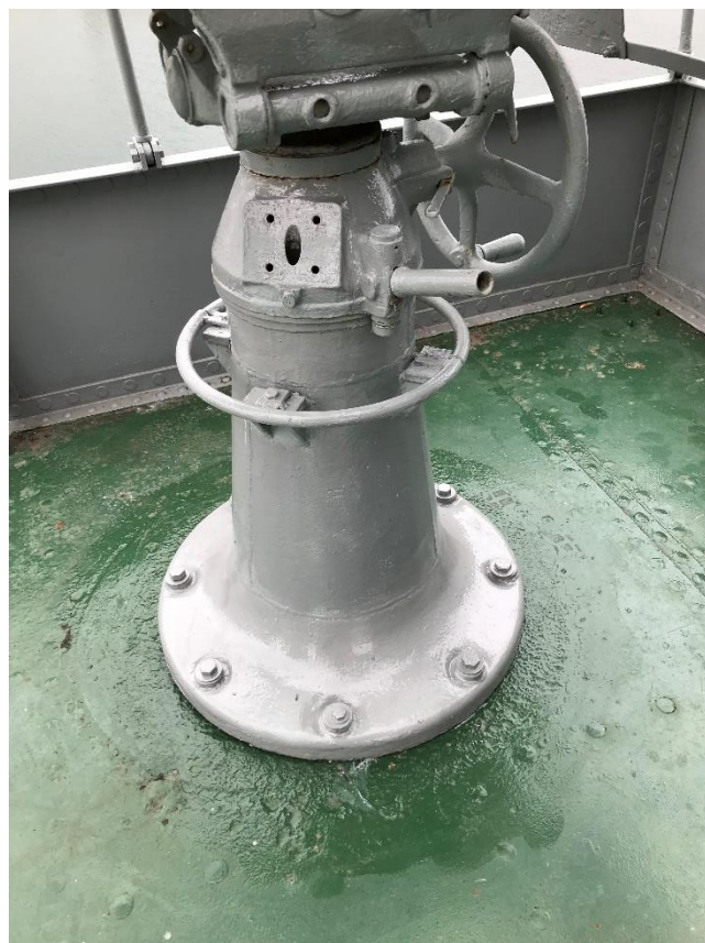
Good for another twenty years

Work has also been undertaken on one of our mines on the after deck. There was a lot of rust around where the top of the mine bolts to the body so the top was taken off. There was found to be some water in the mine, maybe left over from when the mines were filled with water for ballast many years ago. This is still an ongoing project.